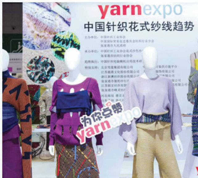
China Knitted Fancy Yarn Trends Display Zone