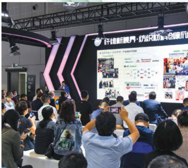
China Fibre Fashion Trends Display Zone & New Fibre Horizon – Textile Material Innovation Forum and Product Launch Conference

Further ensuring Yarn Expo answered the current and future needs of the industry, a number of themed areas and events were featured at the fair.